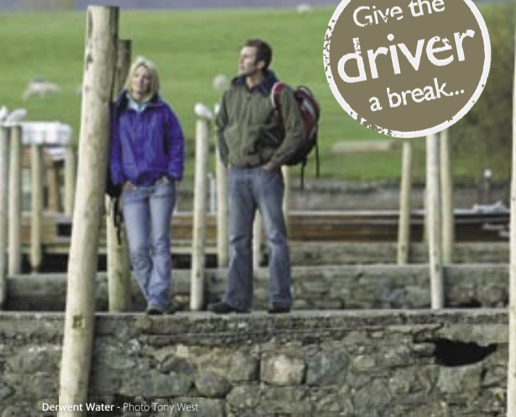
Derwent Water