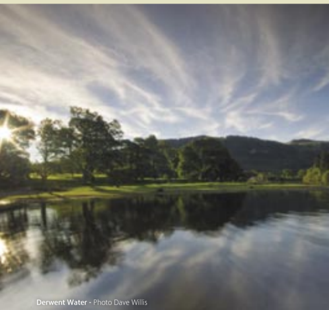
Derwent Water

From 4th April to 31st August (runs Sat, Sun, Public & school holidays). Linking Keswick with Bassenthwaite Lake, taking in Whinlatter and the osprey viewing point at Dodd Wood. Look out for the leaflet or visit www.bassenthwaite-reflections.co.uk