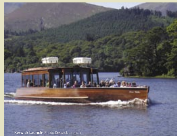
Keswick Launch

Keswick Tourist Information Centre. Tel. 017687 72645.