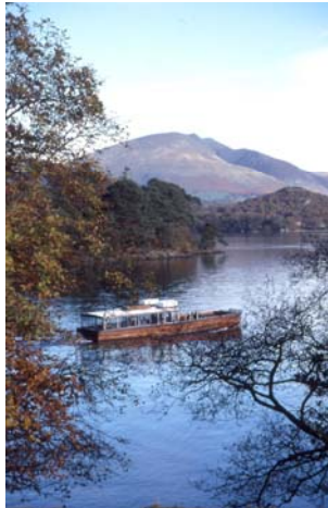
Launching stage at Hawse End

This walk starts at Hawes End which can be best reached by taking the Launch from Keswick to Hawes End landing stage or alternatively by car (limited parking) and by bus. If you arrive by launch follow the path up to the road away from the lake shore.