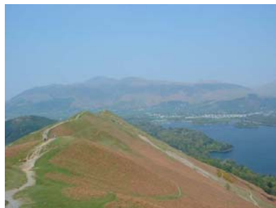
From Catbells looking back to Keswick

After the required stop, the photos, the pat on the back and general enjoyment of the views, descend south to the saddle of Hawes Gate