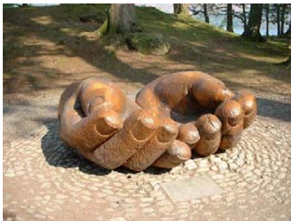
Sculpture in Brandlehow Woods

Now follow the lakeshore path through the wooded shore line, passing High Brandlehow Landing stage and then Low Brandlehow, eventually returning to the start point at Hawse End.