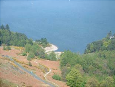
Looking towards Brandlehow Bay from Hawse Gate

From Hawes Gate descend the steep but made up path left (East). Pass the short cut with sign “No Path” and continue down. Take the path left towards a plantation of conifers. Here you join the main terrace path but your direction is down following a dry stone wall to the road. Follow the road left for approx 50 metres and turn right down to the lakeshore at Brandlehow Bay past the old mine workings.